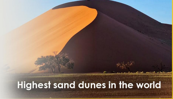
Highest sand dunes in the world

A real journey of rides through landscapes and culture